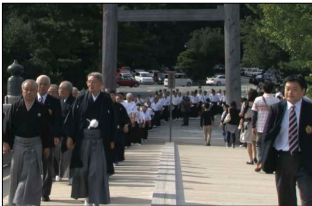
Emperor's Cup - Entrance