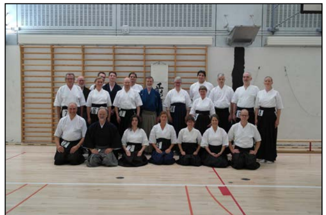
Scandinavian Seminar 2014