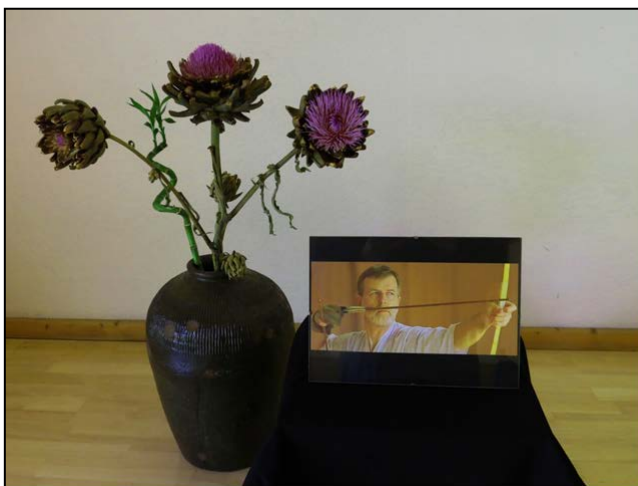
Alster Dojo - Kamiza

1. Instead of a yawatashi all participants performed Mochimato-Sharei commemorating O'Brien sensei. A picture was placed in the Kamiza;