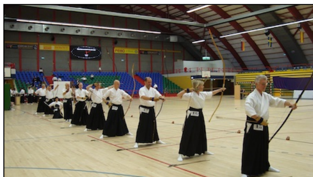
Venue: Sportshall Zuid Amsterdam (EKF Taikai 2013)

The Kyudo events in Amsterdam will offer three seminars with shinsa. In 2016 the IKYF will also be celebrating its 10 th anniversary. A special Koryu Enbukai will be held followed by a reception to celebrate the occasion. The KRN would like to invite kyudo practitioners from all over Europe to join in the IKYF European Kyudo Events 2016 near Amsterdam.