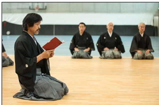
Reciting of Raiki Shagi and Shaho Kun