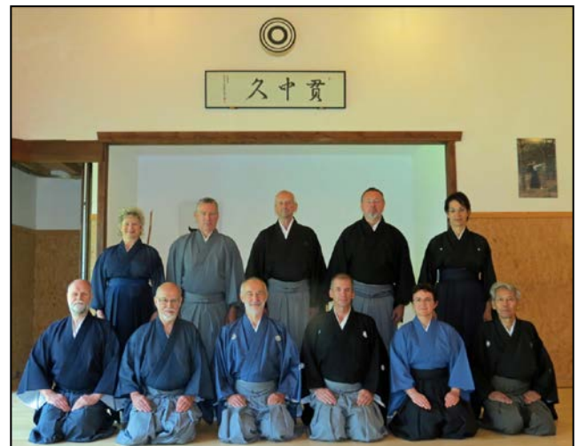
Participants of the fourth EKF Shogo Benkyokai

7. Discussion on the 2016 seminars, guidelines and or wishes to the ANKF/IKYF;