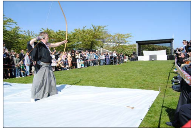
Copenhagen - Sakura Festival