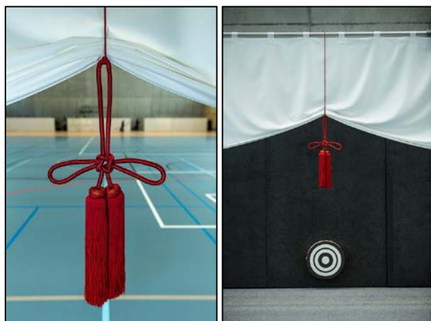
Shajo and Azuchi

For the organization and administration the French Kyudo Federation kindly offered their guidelines and instructions they received from the ANKF to organize the events in Paris a year ago. These were translated into English and are now made available to the next organizing host federations. Further moving towards sustainability the partition screens were offered to the Dutch Kyudo Renmei for free. They were picked up at the end of the seminars and already moved to the Netherlands to be used at next years IKYF events.