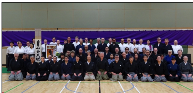
Tsuito Shakai, February 2016