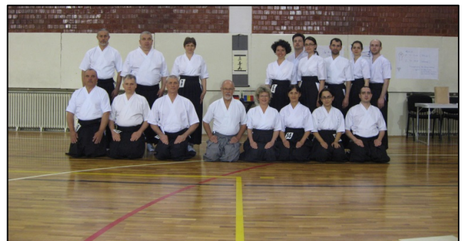
National seminar, Bucharest, Romania, April 2013